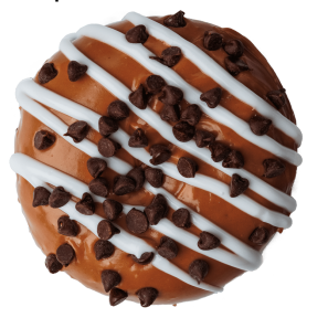
Uncle Joe's Nutella®