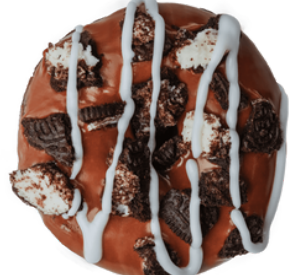
Chocolate Covered Oreo