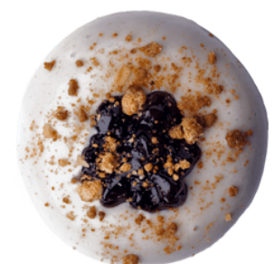
Brown Butter Blueberry